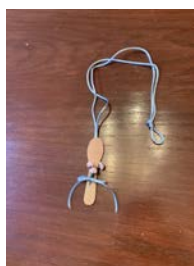
The Wooden Spoon award