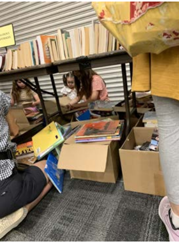
Children seemed to find places to peruse their choices.