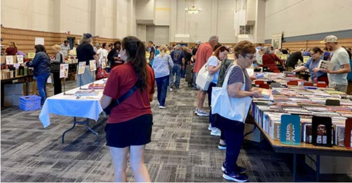
Left, the first day of the sale was busy, but our experienced cashiers, right, made sure no one waited too long.