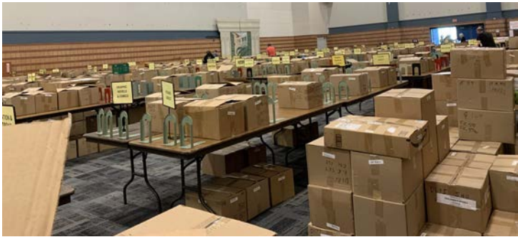
The boxes of books were moved to their proper tables on Wednesday.

October 25-27, 2024 at the Pontchartrain Center