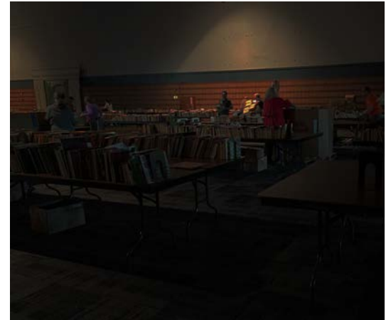
And when the lights go out, the shopping continues on.