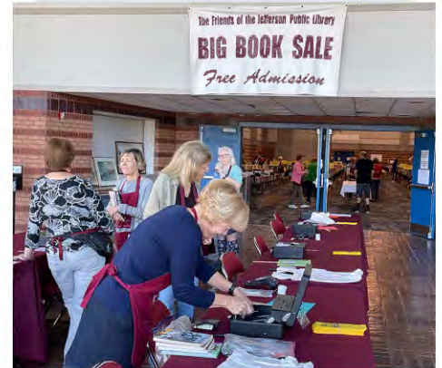
Cashiers getting ready for the crowd.