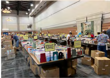
Set Up Day - Thursday, October 23rd Volunteers unpacked boxes to display the books in their appropriate categories.