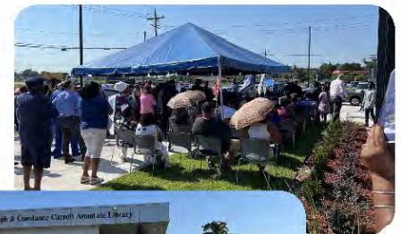
Exterior view of the Avondale Public Library in Terrytown.