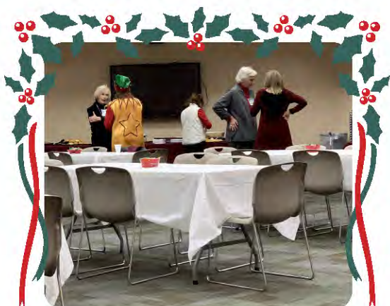
Getting ready for the party.