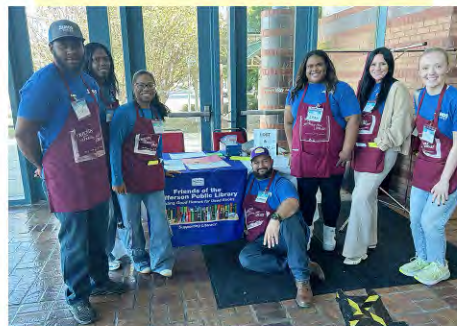
Atmos Group Volunteers (not in order)