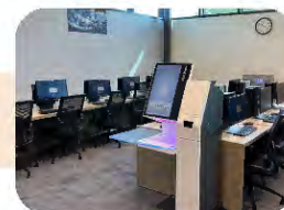
Interior views of the library.