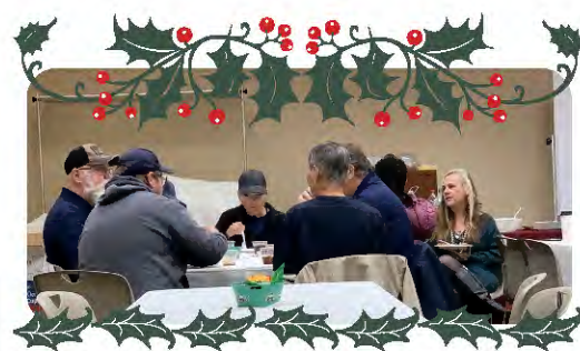
The library staff enjoyed themselves.

Delicious Food, Fun, and Laughter was enjoyed by the Library Staff and the Friends!