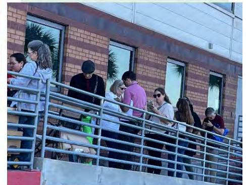
As usual, the line of book lovers snaked all around the building on opening day.