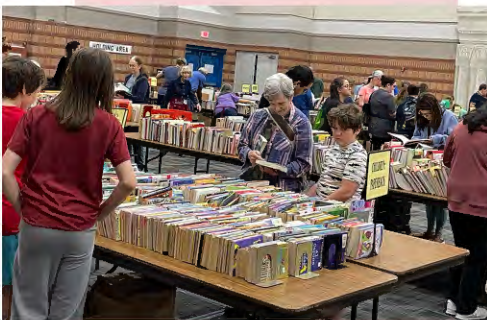
The first hour of the sale on Friday was jam-packed!