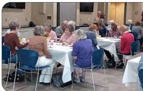
Volunteers enjoying good food and conversation at the Thank You Brunch.