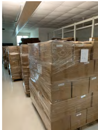
Left, a Friends bin full of books to be palletized. Right, palletized books waiting to be loaded onto the Thrift Books truck.

pallets we had been collecting from around Metairie for the last few months, and discovered that for eight of our pallets, there was not enough space between the top and the bottom of the pallet for our manual pallet lifter. Apparently these pallets were