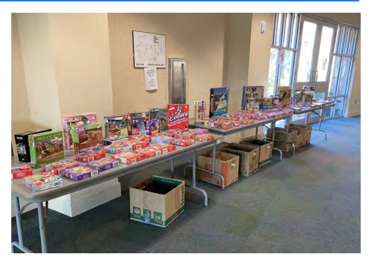
Above: the puzzle mini sale. Below: the cookbook mini sale.

We have been finding good homes for our donated, used books and some other items! The puzzle mini sale in late October netted $1,813.50, and the cookbook/holiday items/DVD sale on No-