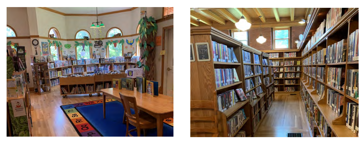
Left: the children's room at the Bill Memorial Library. Right: a view of the shelves in the main room of the library.

Today, the Bill Memorial Library houses 21,000 books and other materials. It has a reference room, children's room, and young adult section, and has a research collection for genealogy and local history. For more pictures of this beautiful building and more about its history, visit the library's website at <a href="https://www.billmemorial.org/history">https://www.billmemorial.org/</a> <a href="https://www.billmemorial.org/">https://www.billmemorial.org/</a>